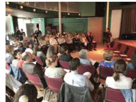
↑ Arts & Culture Summit May 31, 2018 at One Longfellow Square