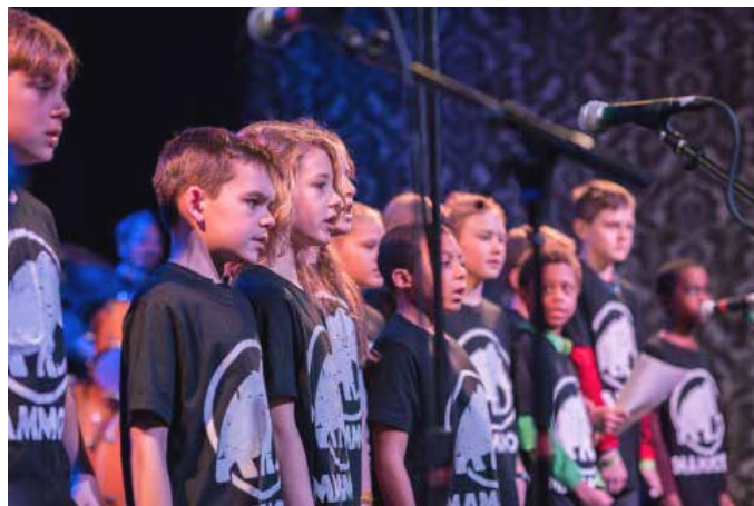
↑ MAMMOTH Rock Chorus

MAMM's new MAMMOTH programs allow the school to broaden its reach across genres and instrument families. MAMMOTH consists of three major components: MAMMOTH Brass Band is a New Orleans style brass ensemble for students ages 10 to 18. MAMMOTH Rock Chorus brings local children and teens together to rehearse and perform popular songs. MAMMOTH Strings offers students a unique chamber music experience. Under the guidance of local musicians and educators, students will have a chance to collaborate with other young musicians, allowing for opportunities to build on individual skills while fostering a sense of responsibility to their peers.