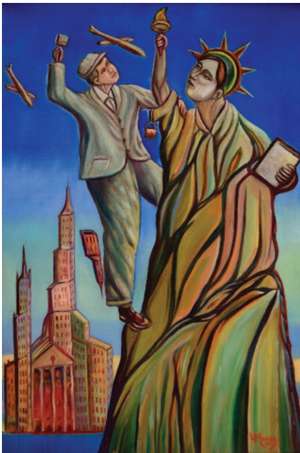
▲ Louis Monza, "Lady Liberty," oil on canvas, 1945

Congress Square Park carolinecotter.com | congresssquarepark.org