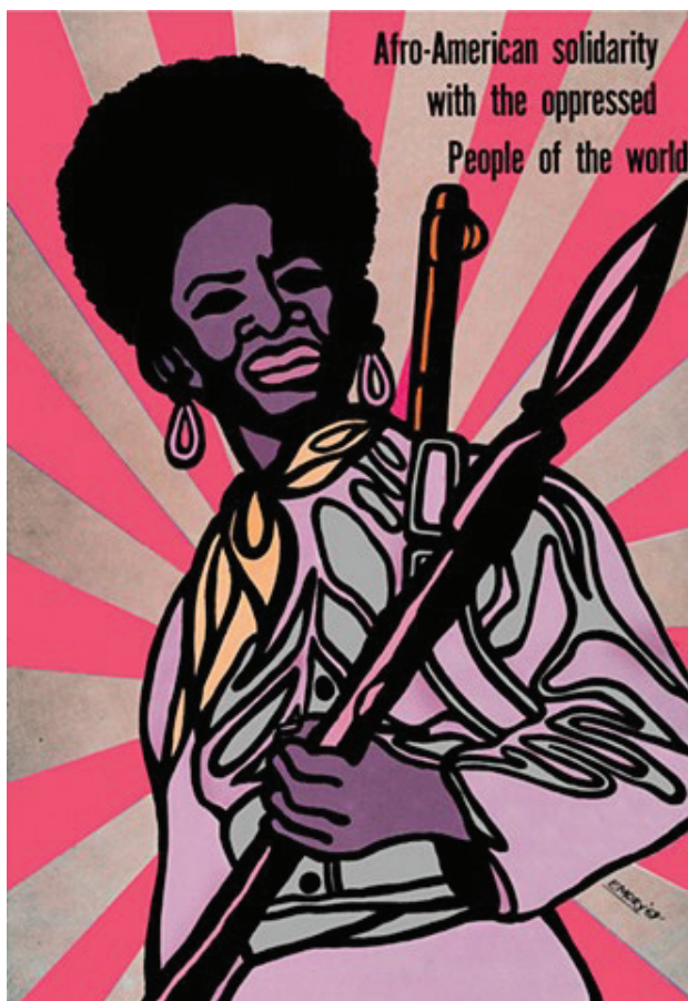
▲ Emory Douglas