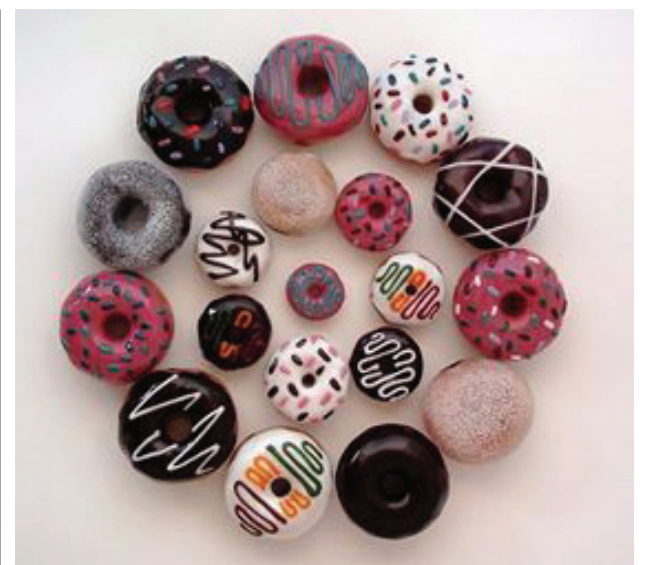
▲ KGB Glass

Able Baker Contemporary 29 Forest Avenue | ablebakercontemporary.com